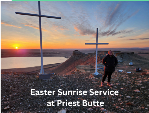
Easter Sunrise Service at Priest Butte